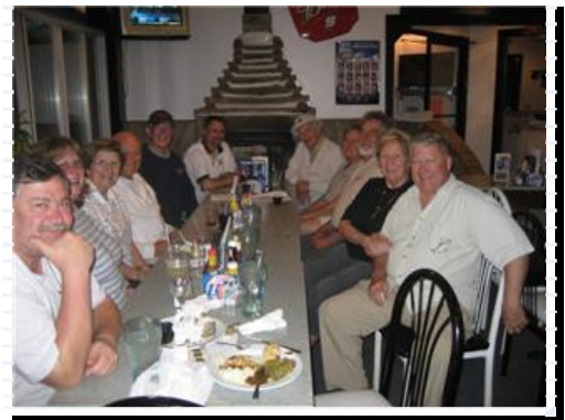
Coles Point Restaurant – AC's