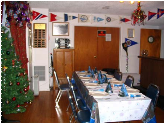
New Year's 2010