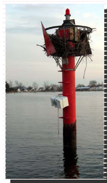
New Year's Day Prank? Where did the addition to Buoy #4 come from???