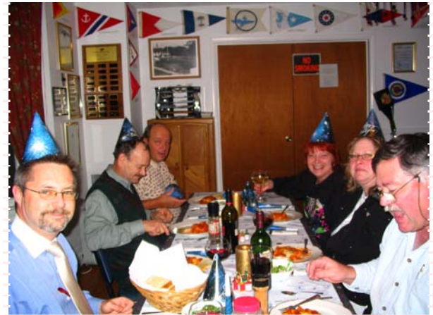
Toasting the New Year and remembering those who are no longer with us.