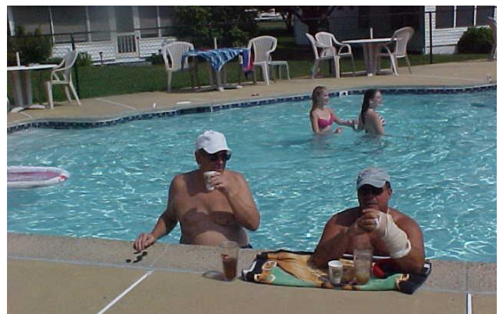
LCYC members enjoying margaritas by the pool