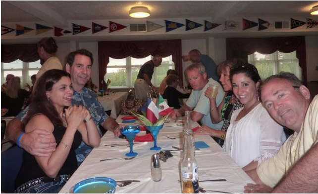
CYC welcomes iLuMiNa Solutions