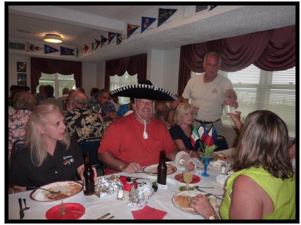
A few of the Lodge Creek visitors