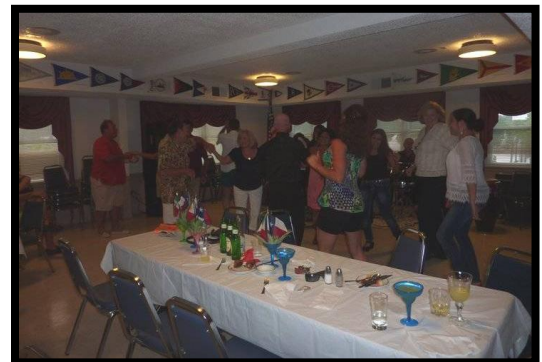
Excellent dance band - Luz de America