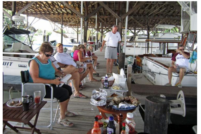
B-Dock Sunday Brunch