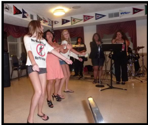
“Luz de America”