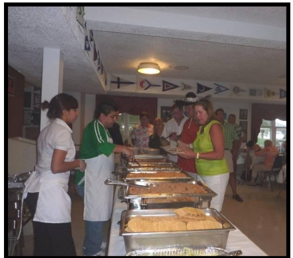
Caterer – Cerro Grande