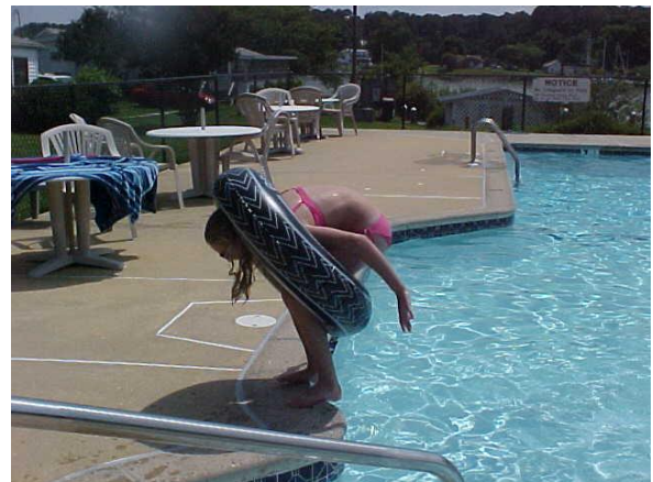
Stuck in a tube – No Problem