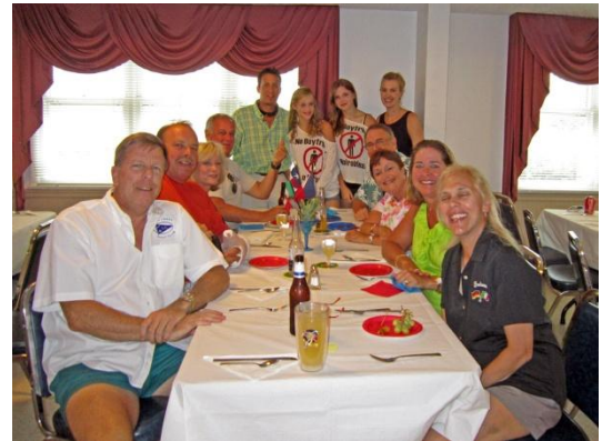
LCYC All together